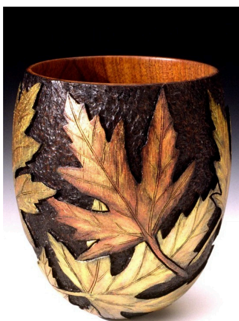
Pyrography, Power Caving and colouring with Acrylic Paints