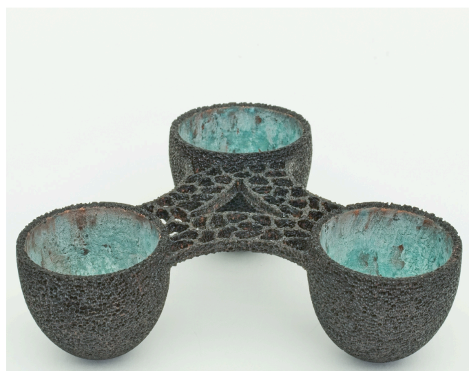
Toru series demonstration