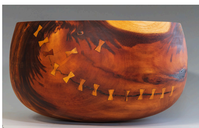
Hawaiian Calabash Demonstration