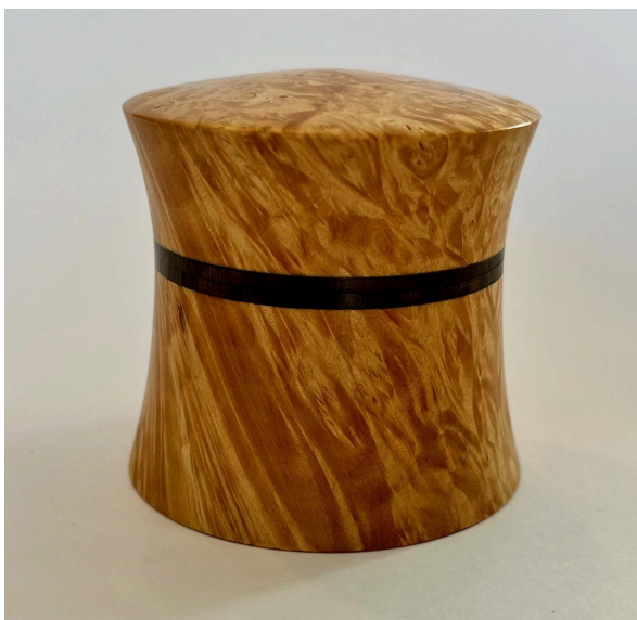
Beautiful Box, Basic Tools